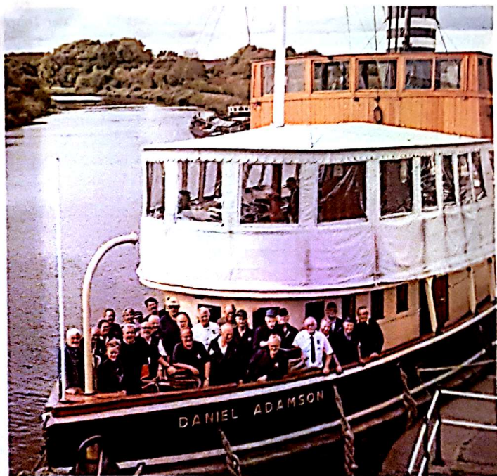
A crew photo on arrival at Acton Bridge.