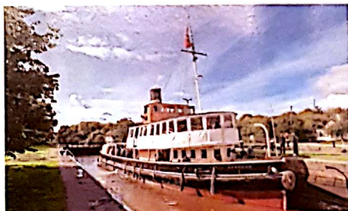
The Danny negotiates Dutton Locks.