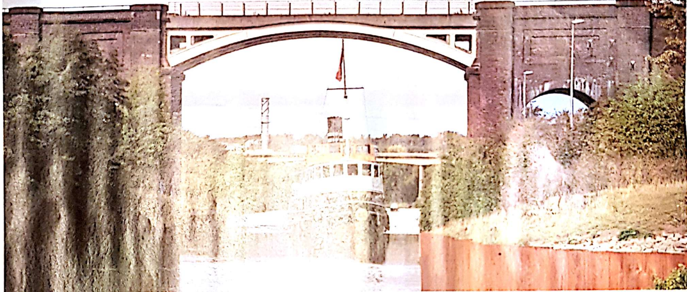
SS Daniel Adamson on the Weaver Navigation passes under the Warrington to Chester railway line at Sutton Weaver, en route from Ellesmere Port to Acton Bridge on September 30, 2016.

FOLLOWING months preparing for an important MCA (Maritime & Coastguard Agency) certification the 1903 Daniel Adamson steam ship has now passed and as a celebration was able to cruise with passengers along the River Weaver, which has been enabled through the work of the Canal & River Trust.